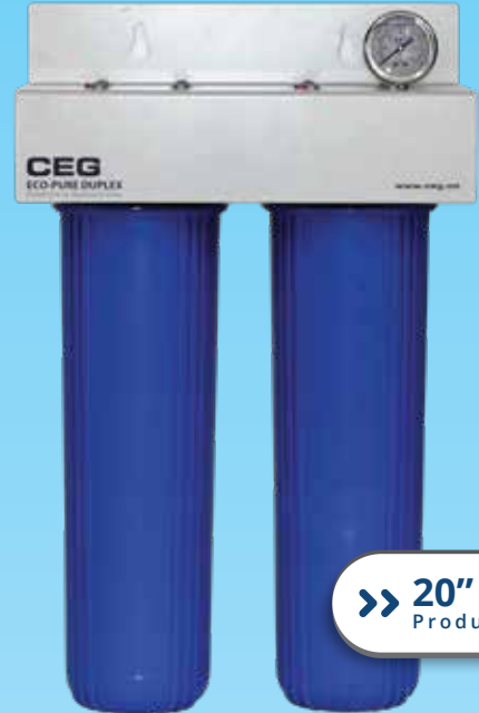
>> 20" DUPLEX MAINS Product code #5570270000