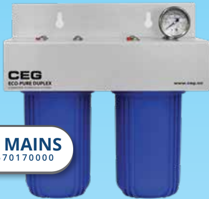
>> 10" DUPLEX MAINS Product code #5570170000